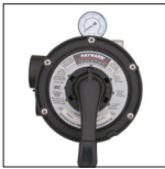
Vari-Flo™ 6-position valve