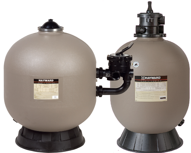
ProSeries™ HB Side