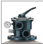
Sand easily accessible by removing the collar